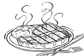
Plate lunch with meat dish, salad and bread or rice